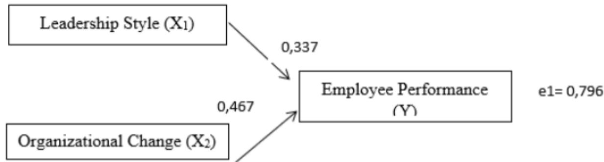
Fig.1: Model I Path Diagram

Based on table 5, we can see the value e_1 in model summary table of Model 1 path in column R Square of 0.366. This means e_1 = \sqrt{1-0.366} = 0.796 . Then it can be known that the value e_1 = 0.796 . Thus obtained model I Path diagram as follows: